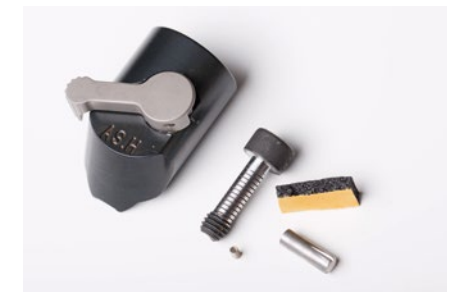
3-position safety TIKKA T3 right

Make your Tikka T3 safer. We have developed a 3-position safety to replace your standard 2-position safety for left or right actions. The original plastic shroud is replaced by our blued steel shroud. The safety now engages directly on the firing pin. The