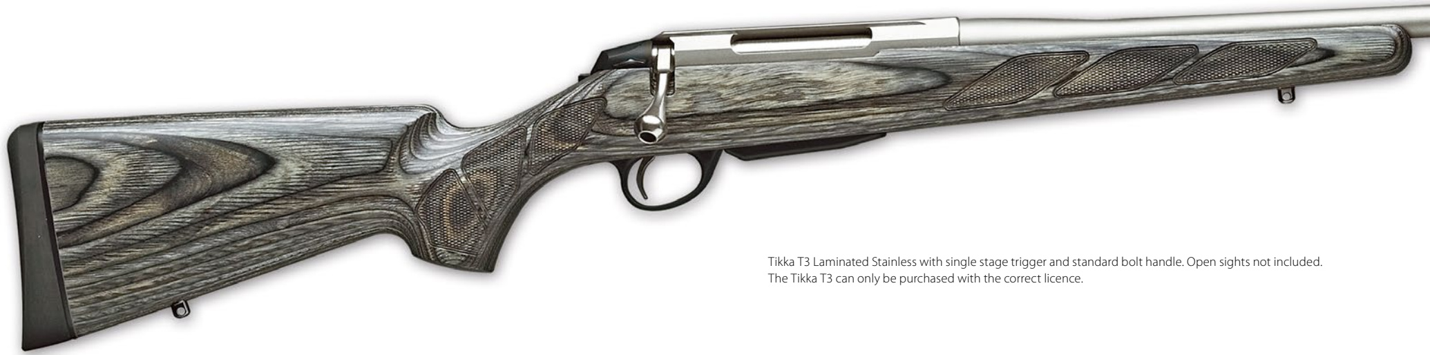
Tikka T3 Laminated Stainless with single stage trigger and standard bolt handle. Open sights not included. The Tikka T3 can only be purchased with the correct licence.