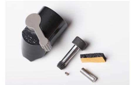
3-position safety TIKKA T3 left